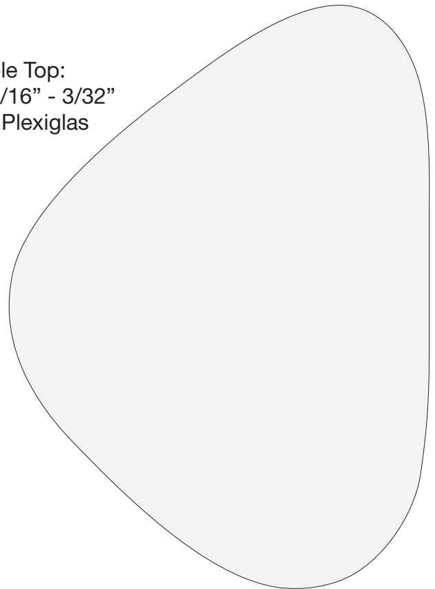
Table Top: Cut on 1/16" - 3/32" Thick Plexiglas

Instructions: Cut out and apply the scroll saw pattern to the material with clear tape and/or spray adhesive. Cut out the shapes with a scroll saw, following the lines. Shape the curve of the table legs to your preference, or leave as is. Sand the table legs to make sure that the fit is level. Glue the table legs together with wood glue, using the guide below. Finish the table legs in a color or stain of your choice. Then using the guide below, glue the table legs to the table top with a polyurethane based glue or leave the table top and base unattached.